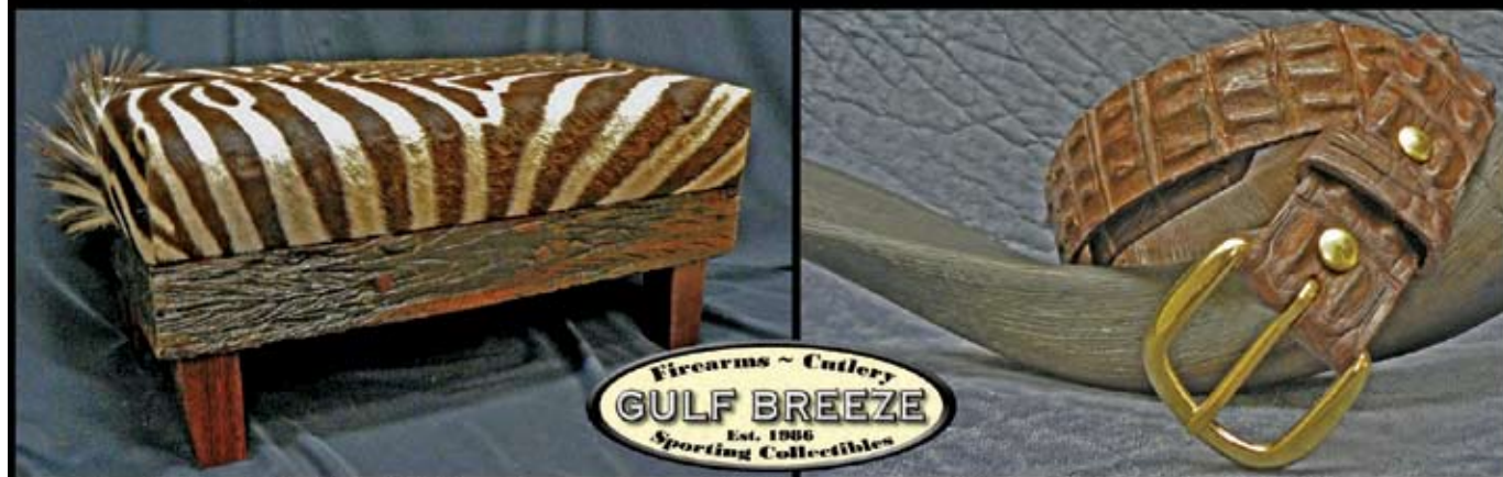
Handmade Zebra Hide & Teak Railway Sleeper Ottoman $2,295

Gulf Breeze Firearms is America's Premier Big Game Rifle Dealer and Purveyor of Fine Game Hide Accessories from Around the World.