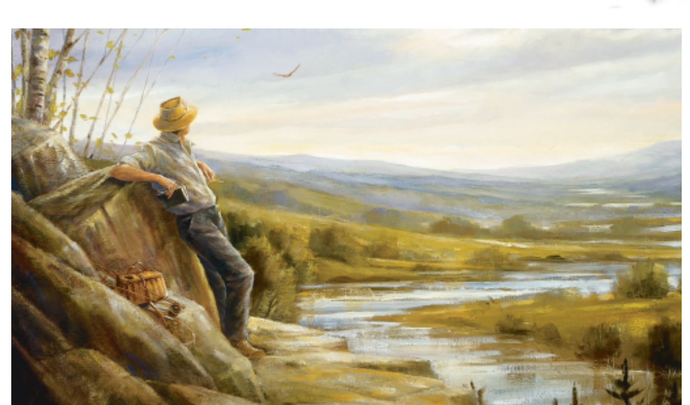
PAINTING BY ROD CROSSMAN

The music of the West Fork played soft and sweet. Happy it seemed, but perhaps a little nervous about the future. Yet maybe those were his emotions rather than the creek's.