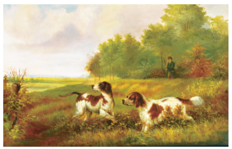
SETTERS ON POINT HOWARD HILL American, fl. 1860s Oil on Canvas 24 x 32 inches

AMERICAN & EUROPEAN SPORTING PAINTINGS FROM THE 18TH TO 21ST CENTURIES