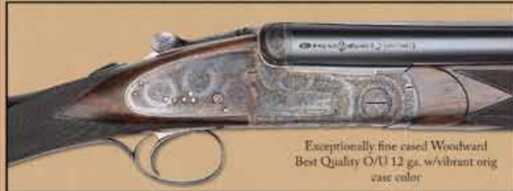
Exceptionally fine cased Woodward Best Quality O/U 12 ga. w/vibrant orig case color