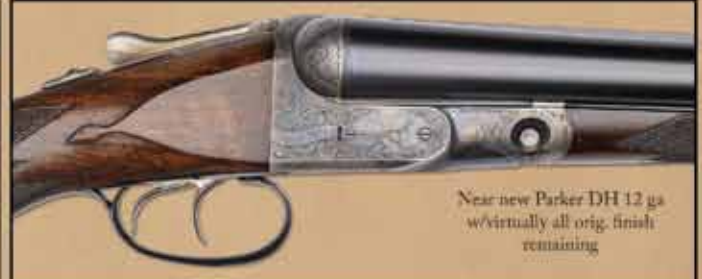
Near new Parker DH 12 ga w/virtually all orig. finish remaining