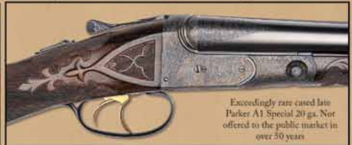
Exceedingly rare cased late Parker A1 Special 20 ga. Not offered to the public market in over 50 years