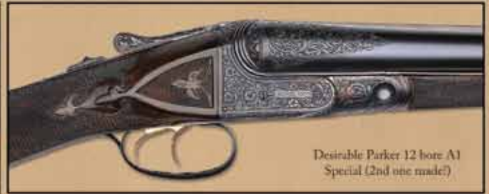
Desirable Parker 12 bore A1 Special (2nd one made!)