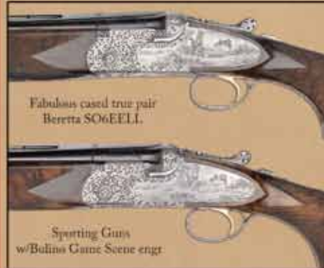
Fabulous cased true pair Beretta SO6EELI